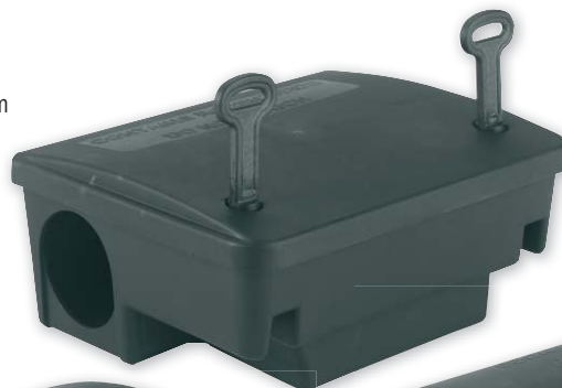
299636 with wall mounting plate