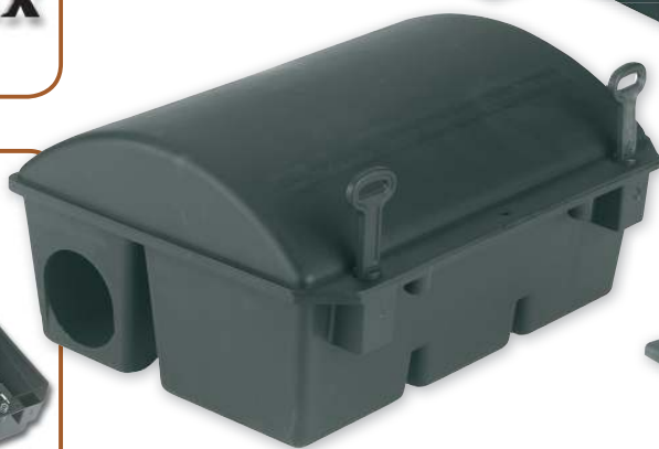
299635 with wall mounting plate